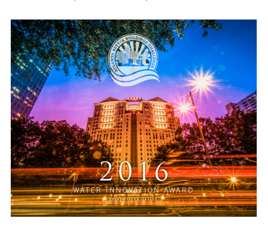
Water Innovation Award Grand Hyatt Buckhead