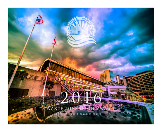
Waste Diversion Award Georgia World Congress Center