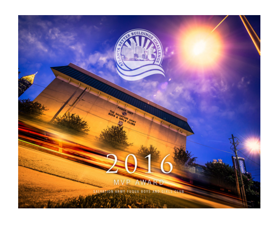
MVP Award Salvation Army Fuqua Boy and Girls Club